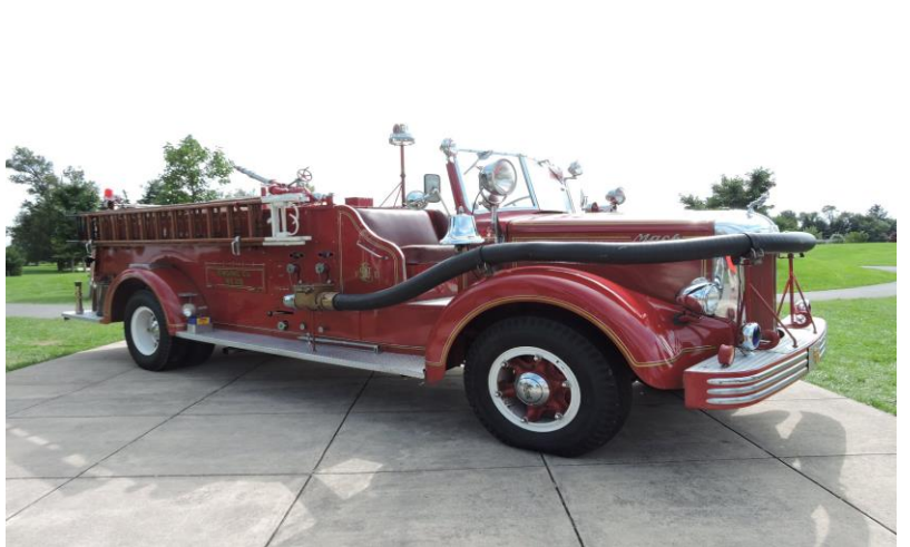
JUDGES AWARD – 1950 MACK L MODEL ENGINE, EDDIE SCHWARTZ