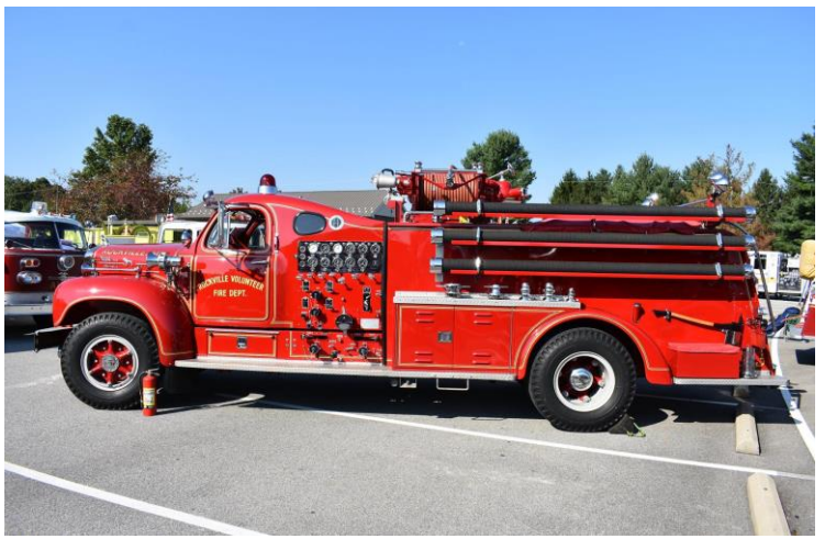
BEST ORGANIZATION OWNED MACK B-85 ROCKVILLE FIRE DEPT.