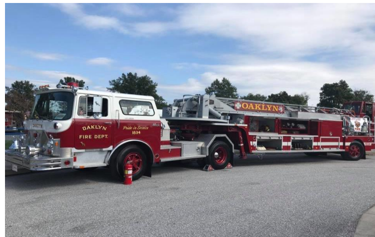
BEST PRIVATELY OWNED 1974 MACK CF 100' TILLER TRUCK THE GIBNEY FAMILY