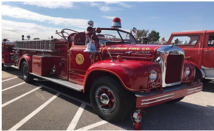
BEST IN SHOW 1954 MACK B-95 RADNOR FIRE CO.