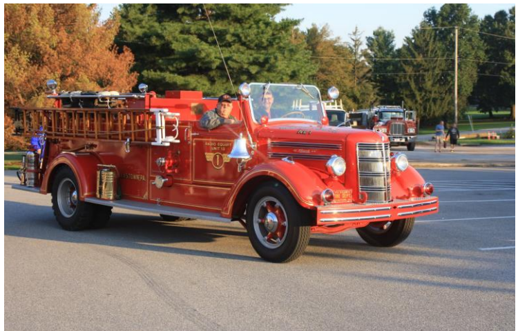
BEST MACK 1940-1960 - 1948 MACK S-45 ENGINE, RESCUE FIRE CO. DALLASTOWN